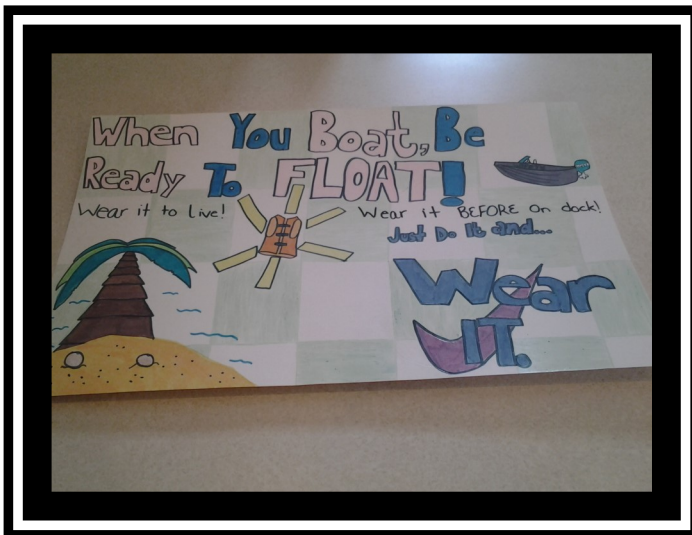
12-14 Age Group: Alyssa Goodwin, Northern Neck Power Squadron