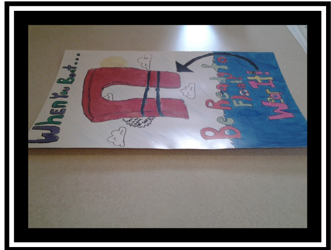
9-11 Age Group: Bay Wiggins, Northern Neck Power Squadron